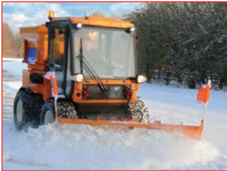
...a snow plough...