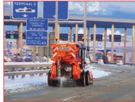
...a salt spreader...