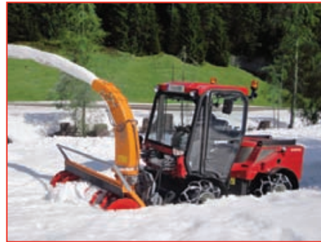
...a snow blower...